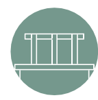
Timber frames and joists