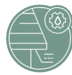
Waste wood from hydraulic