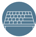
Tiling, cladding and battens