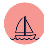
Wood from boats or ships