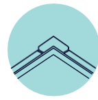
Barge boards, fascias & soffits