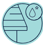
CCA treated wood Creosote treated wood