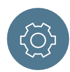
Engineering (e.g. Docks)